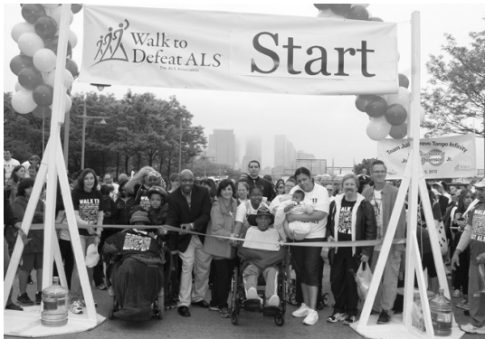
The start line at the 2012 New York City Walk to Defeat ALS.

The Kentucky Derby wasn't the only exciting event taking place on the first Saturday in May! On May 5th a record number of PALS, family & friends participated in the 5th Annual New York City Walk to Defeat ALS. A gathering of nearly 2,000 supporters wound their way up Manhattan's Hudson River waterfront, raising much-needed awareness and funds. For the first time ever, partners from around the globe were able to view the Walk through the Chapter's live video stream! Viewers from as far as Italy and Finland got to witness the excitement and see their loved ones cross the finish line to the backdrop of Manhattan's majestic skyline! If you missed the NYC Walk, view the live stream on our website at http://als-ny.org/videos/NYC-ALS-Walk.html .