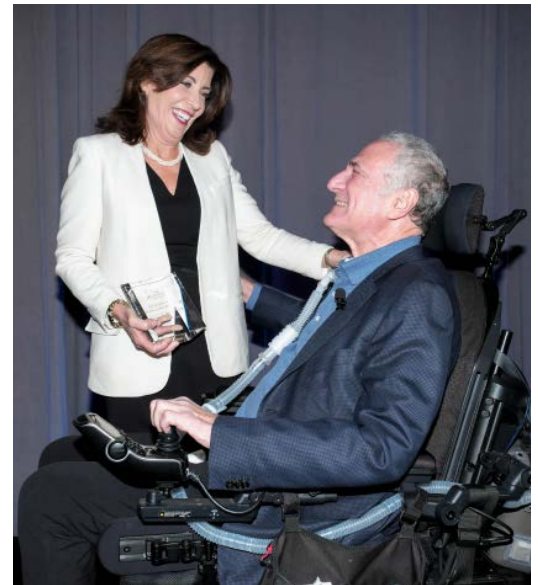
Governor Kathy Hochul and Dan Doctoroff