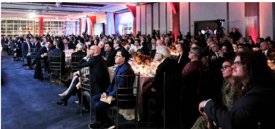
Lou Gehrig Legacy Gala at Pier Sixty