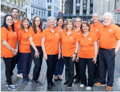
Your Greater New York Care Services Team

For more than 30 years, ALS United Greater New York has been the region's leading provider of ALS services. Backed by a team with over 192 years of combined experience, we deliver expert, compassionate care through our dedicated staff and clinic partners, supporting patients and families across New York and New Jersey.