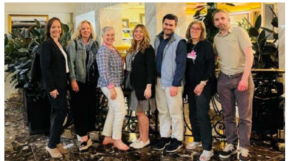
ALS United Greater New York Staff and advocates gather for the I AM ALS Summit