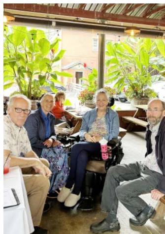
Hudson Valley Patient and Family Day at Melzingah Tap House

As the year concluded, we introduced the Joseph Cotrone Holiday Dinner Program at Patrizia's. A new tradition reflecting our dedication to care, connection, and compassion.