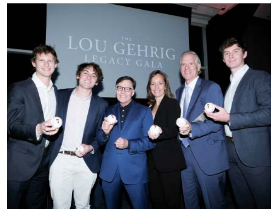
Lou Gehrig Legacy Gala attendees with Bob Costas