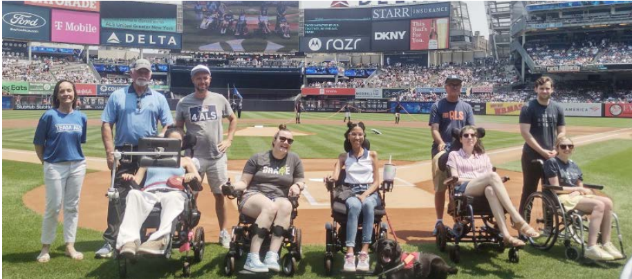
Raising ALS awareness at Yankee Stadium with ALS United Greater New York, Quinn for the Win, ALS Ride for Life, Her ALS Story, and I AM ALS