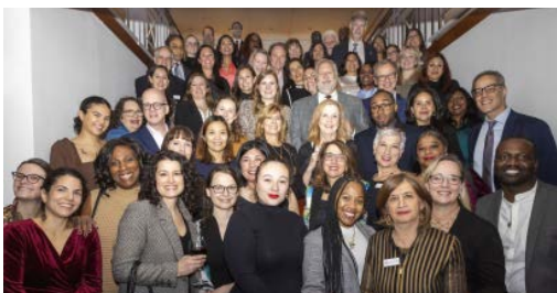
Our dedicated staff and clinic teams across Greater New York gathered at the Lou Gehrig Legacy Gala

Our Equipment Loan, Home Accessibility, and Assistive Technology programs continue to be productive! We are increasing our scope to meet the growing needs of our community. In 2024 we added 165 new pieces of equipment to our program and delivered wheelchairs, hospital beds, and power patient lifts to families in all corners of our region. As always, this service is free of charge. In parallel, our assistive technology team conducts virtual home assessments on a regular basis, enhancing safety and accessibility in the home environments.