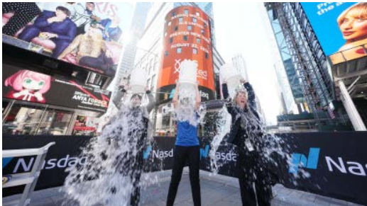
NASDAQ Ice Bucket Challenge