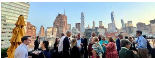
Cocktails and Conversations at the New York Genome Center