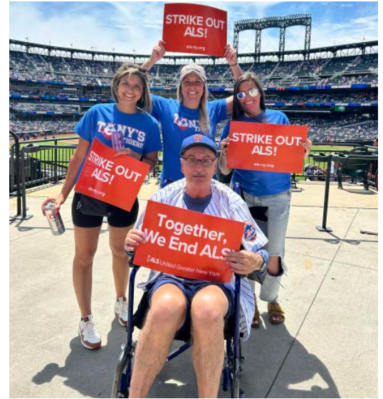
Lou Gehrig Day at Citi Field