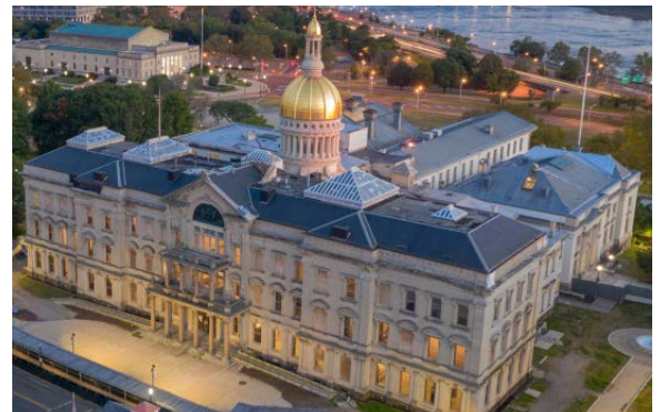
New Jersey State Capitol