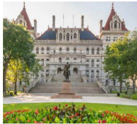
New York State Capitol

In May, ALS United Greater New York, alongside 14 other health advocacy organizations, traveled to Albany advocating for laws to prevent genetic discrimination, particularly in life, long-term care, and disability insurance. These protections are vital, as 10% of ALS cases are hereditary, and families need access to genetic testing without fear of insurer bias. While these bills did not pass this year, we are committed to moving them forward in 2025.