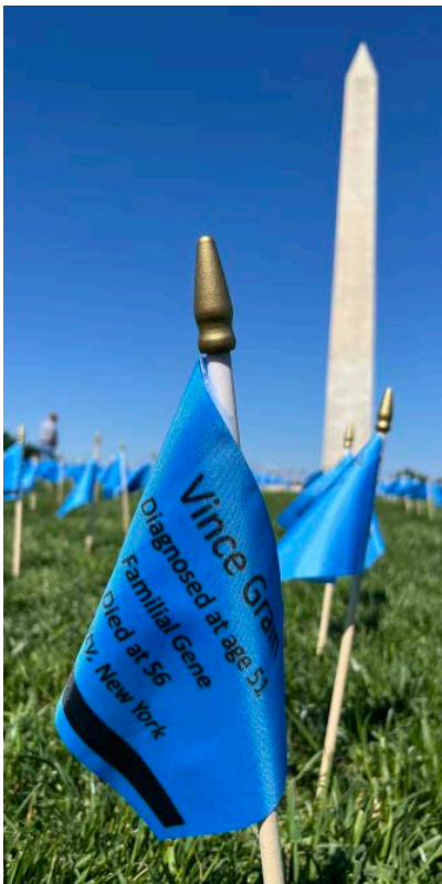
I AM ALS Flag Display on the National Mall