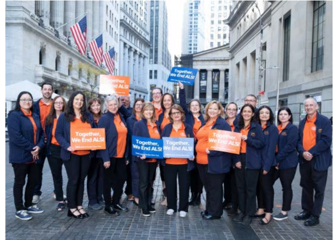
Members of the ALS United Greater New York Team

2024 began with a historic victory as New York Governor Kathy Hochul secured $25 million in the New York State budget for ALS research and other neurodegenerative diseases, treatment, and vital services. Care Services continued to evolve as a cornerstone of our work, with highlights including the 4th Annual Virtual Education and Resource Summit, Hudson Valley Patient and Family Day, and the launch of "Conversations With...", a video series exploring the deeply personal experiences of ALS. We also introduced the Joseph Cotrone Holiday Dinner Program to bring joy to families during the holiday season.