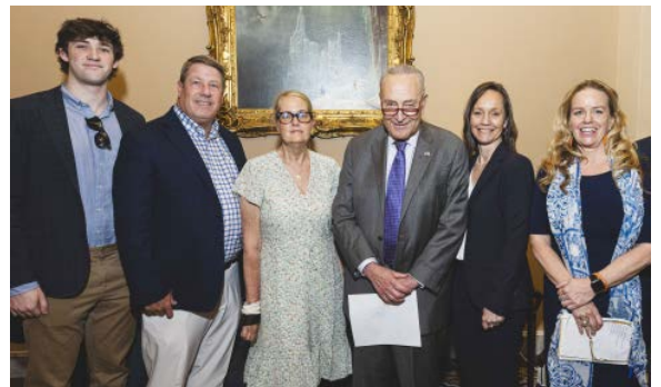
The Craig Family, New York Senator “Chuck” Schumer and ALS United Greater New York Staff

Staff from ALS United Greater New York participated in the I AM ALS Community Summit and the Third Annual DC ALS Awareness Event. They served as moderators and legislative captains while connecting with advocates from across the region. The highlight of the event was the I AM ALS flag display and ceremony on the National Mall, which honored those living with ALS and those we have lost.