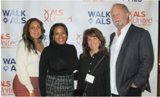
ALS United Greater New York Walk Kick-Off