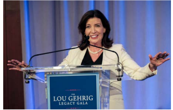
Governor Hochul speaking at the Lou Gehrig Legacy Gala on the importance of ALS research