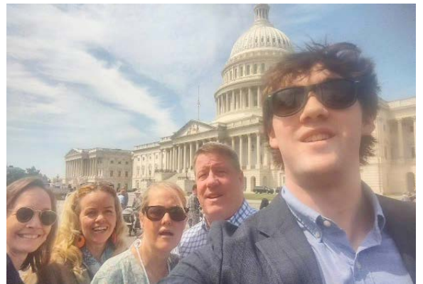
Advocates on “The Hill” in Washington, D.C.