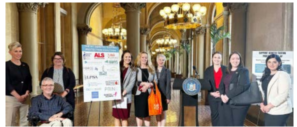
ALS Advocates in Albany