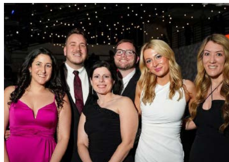
The Iron Horse Party in May